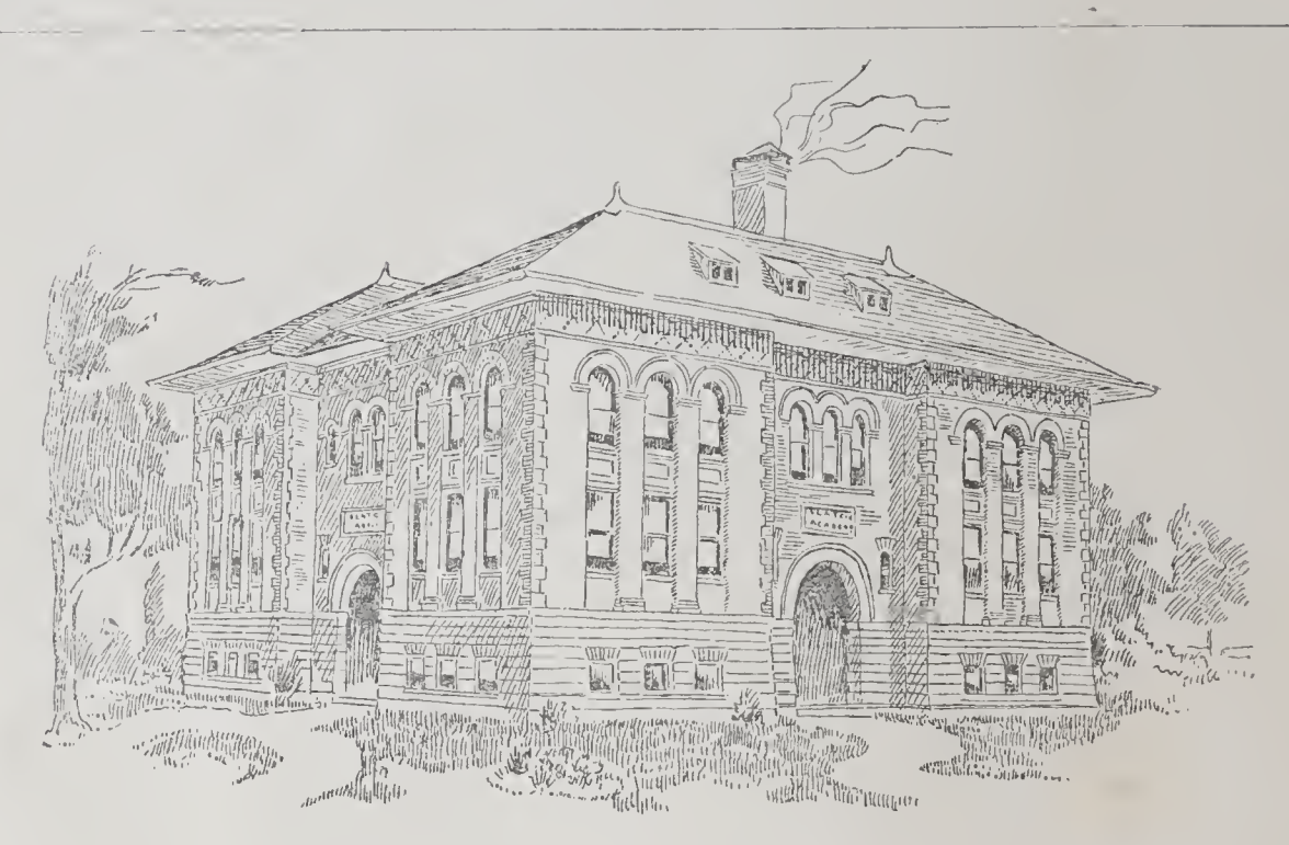
NEW BUILDING AT SLATER, JUST COMPLETED.